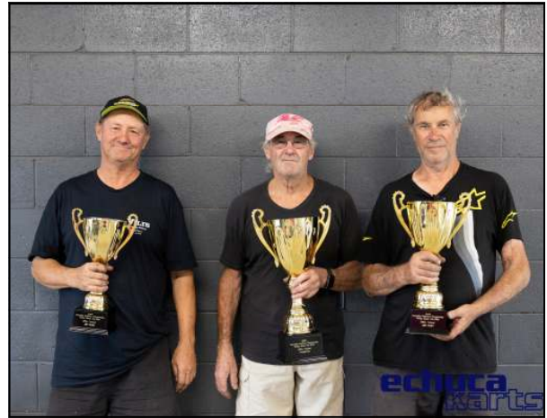
Above: 250/450cc National