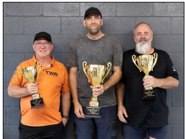
Above: NGB Super Heavy