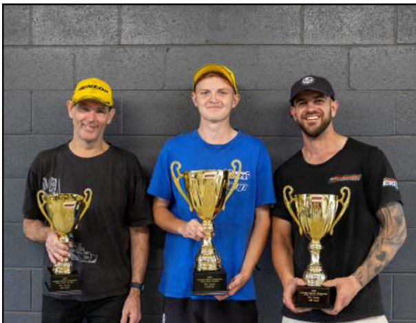
Above: 125cc Open