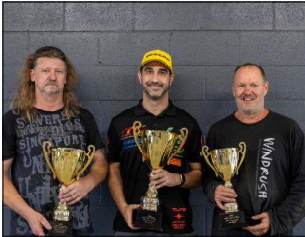
Above: 250cc International