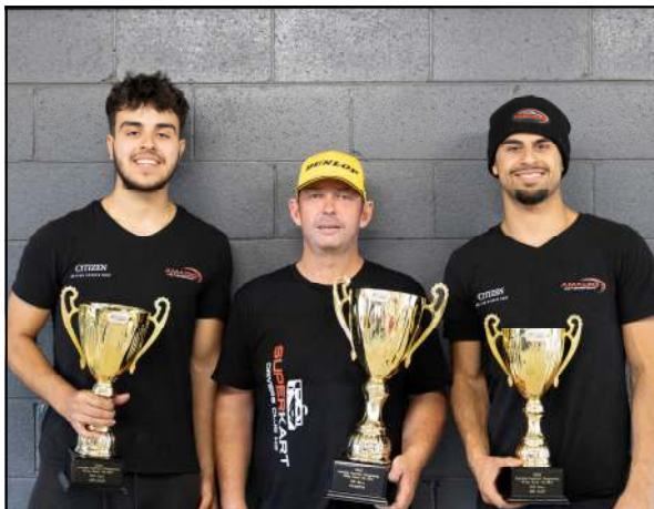
Above: NGB Heavy