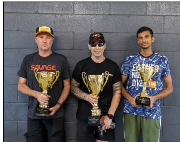
Above: N.G.B. Light