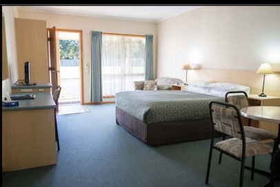
Family unit—2 bedroom

Bookings must be made direct with the Motel.