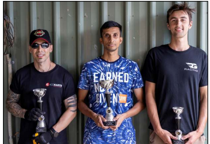
Above: N.G.B. Light