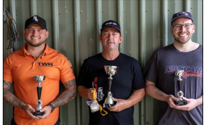
Above: N.G.B. Heavy