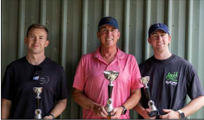
Above: 125cc open