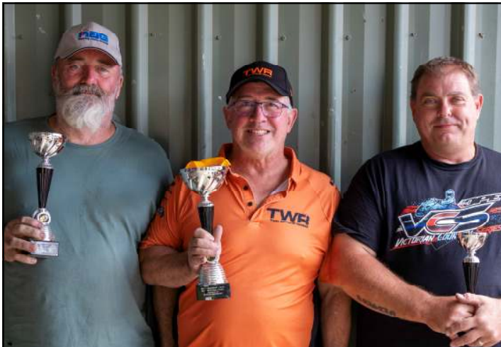
Above: NGB Super Heavy

digital print & signage ph: 03 9587 2695 www.networkpress.com.au