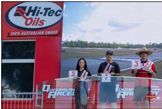
Above: NGB Light