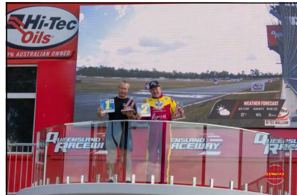
Above: NGB Heavy