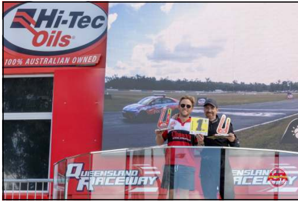
Above: 250 cc International

QLD Superkart Cup & Triple Challenge Round ONE—Queensland Raceway