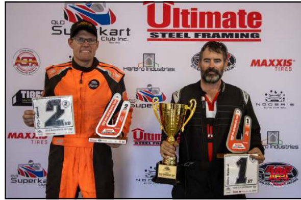
Above: 250—450 cc National